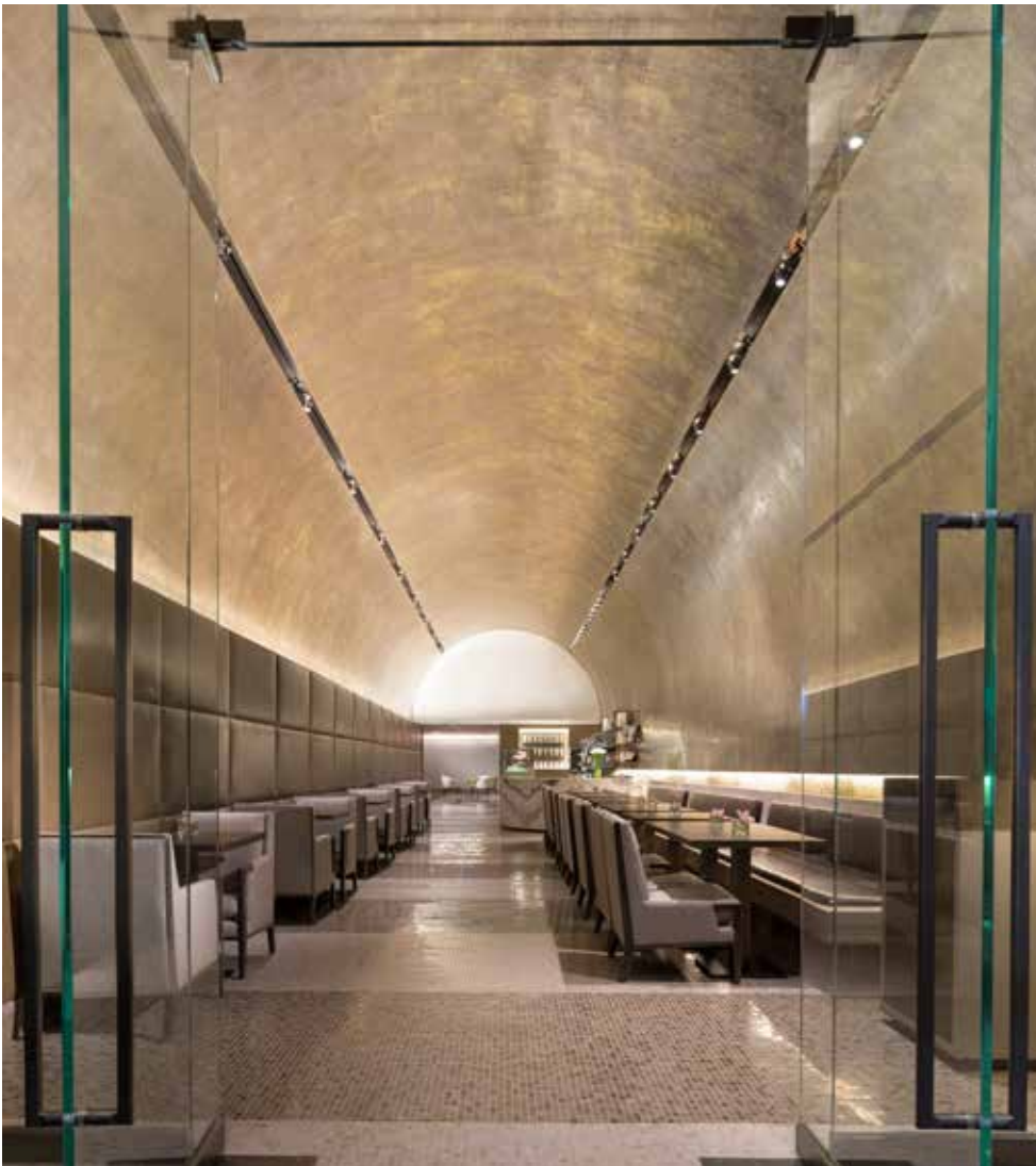
THE KNICKERBOCKER HOTEL