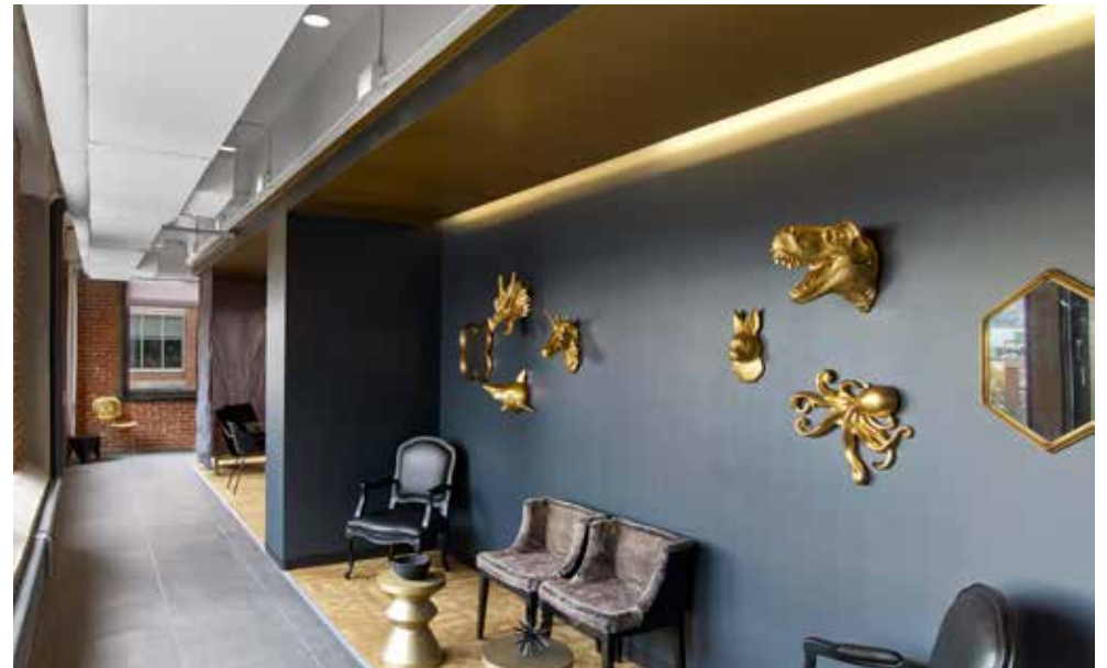
GOOGLE NYC HEADQUARTERS

Dolphin Mall, Ramblas Plaza MIAMI, FL Harbour Front Center SINGAPORE